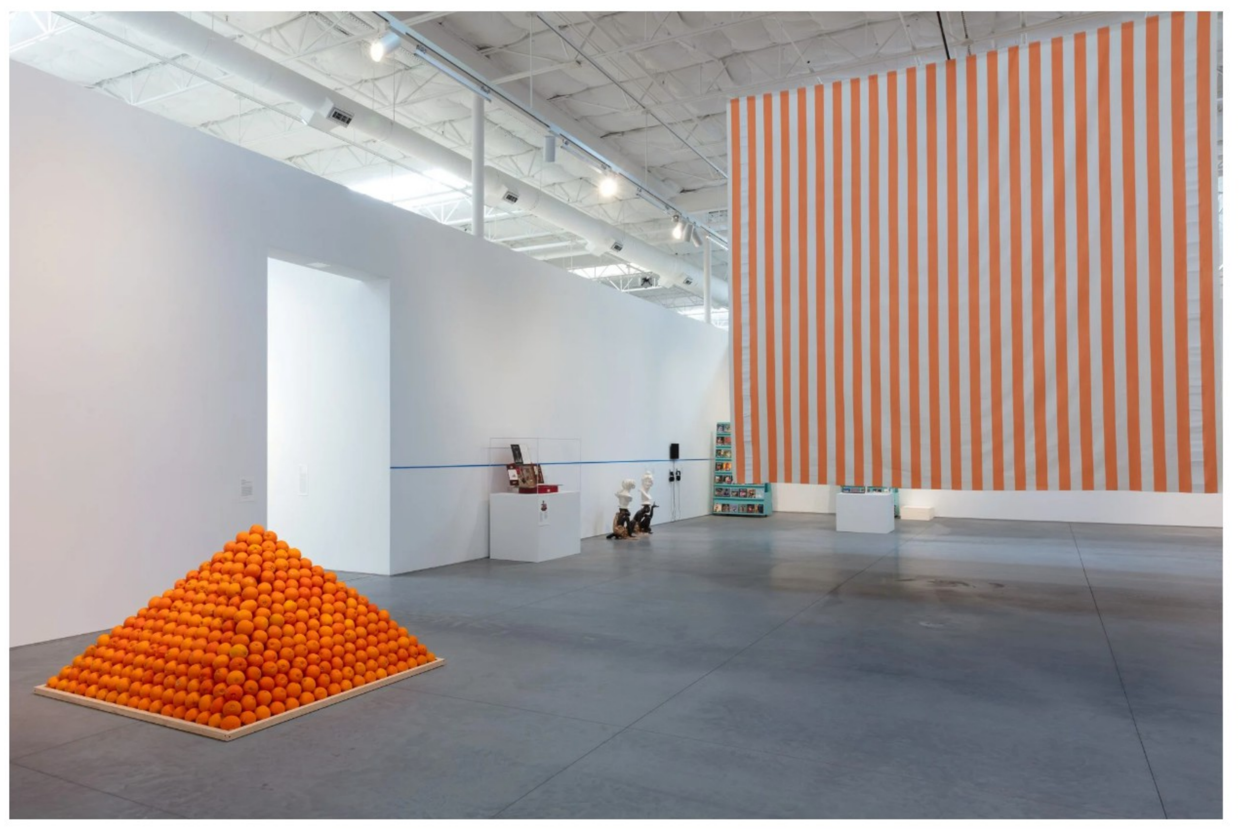
Installation view of "For What It's Worth: Value Systems in Art Since 1960" at the Warehouse, with works by Roelof Louw and Daniel Buren at front.