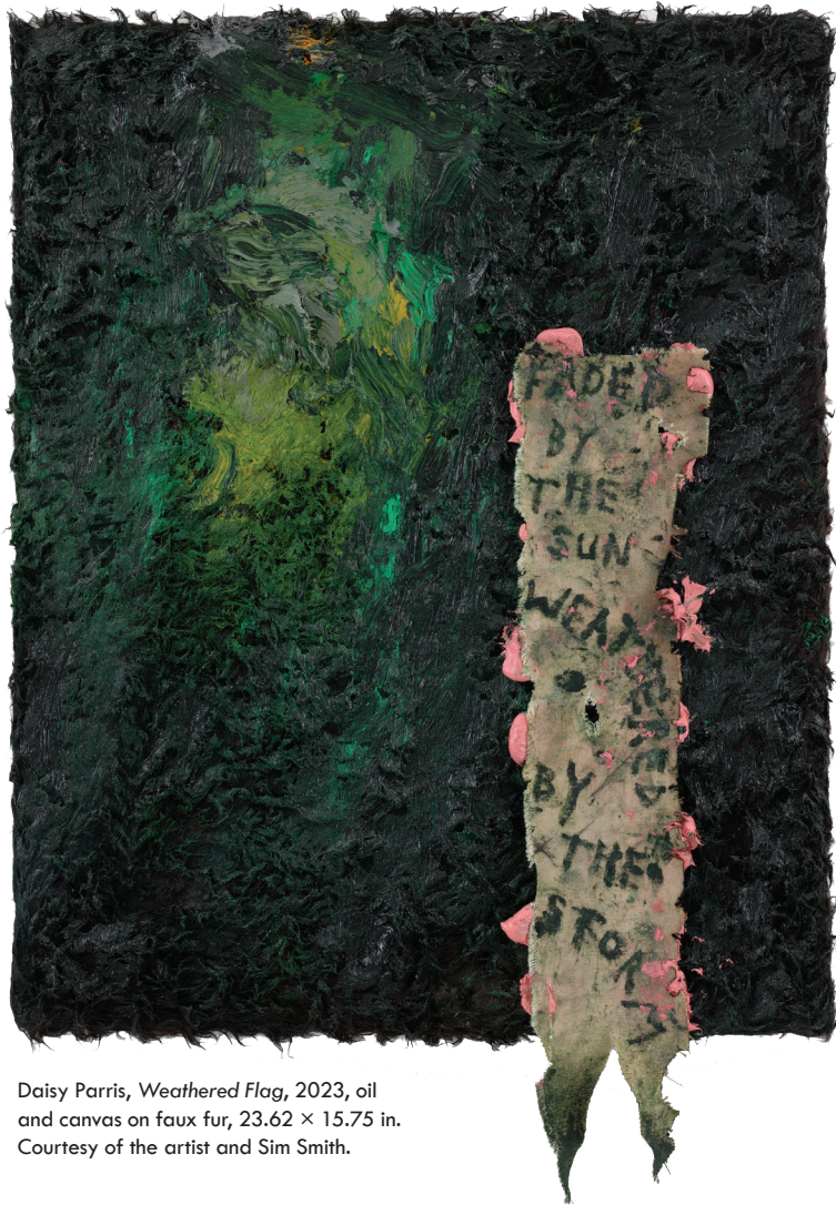
Daisy Parris, Weathered Flag , 2023, oil and canvas on faux fur, 23.62 x 15.75 in.

Equally interested in pathos, human endurance, and resilience, here Parris explores the human capacity to succeed in the face of adversity. A frenetic green impasto supports a long flag-like canvas form displaying text that suggests our human capacity to survive and get through anything life throws at us. The artist brings both aspects together by concluding that “people are storms and people also weather storms.”